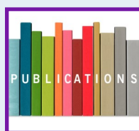
Statutory Publications — new SAR Learning & BSAB Annual Report