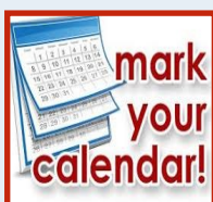
Did you know Modern Day Slavery Training is mandatory for staff?