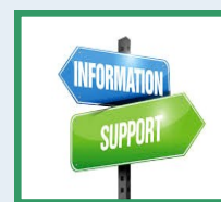
Additional Resources for keeping adults safe