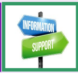
Resources for keeping adults safe