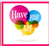
New Strategic Priorities