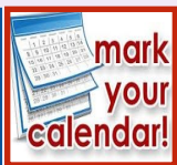
BSAB Annual Report