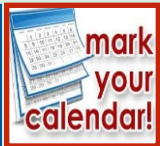
Training Jan-Mar 2020