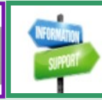
Resources for keeping adults safe