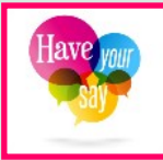
New Strategic Priorities