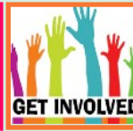
Safeguarding Adult Champions